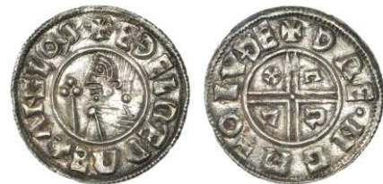
Aethelred II penny of Louth mint

It is also suggested that the hoard, buried around the year AD. 999, could have been formed by a pilgrim making penitence, due to worries about the impending apocalypse of the first millennium. Amongst the 99 silver pennies in the find were coins from two extremely rare mints; the first being Melton Mowbray and the second was a previously undiscovered mint based in the town of Louth, Lincolnshire.