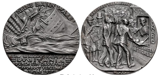
The Lucitania medal

Was the Lucitania carrying weapons? The answer is 'yes' and 'no'. The cargo lists indicated that large quantities of cartridge cases and shrapnel shell cases were in the holds. Not weapons in themselves, perhaps, but essential components of weapons.