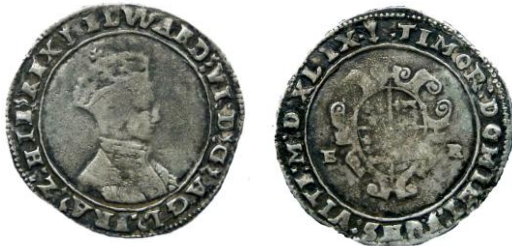
Edward VI shilling dated XLIX (1549) on the reverse

By the fifteenth century, however, more European coinage carried dates; the starter for this period is often ascribed to the Hungarian silver denars, about the size of an English penny, dated from around 1450.