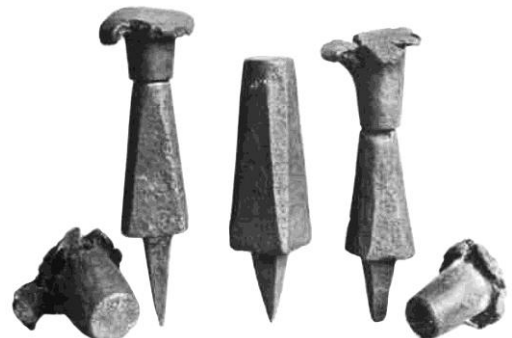
Dies for Edward I coins (c.1278-1307)