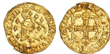
Edward III gold helm

Britain had not had any gold coinage in circulation since the failed gold pennies of Henry III. But why were these gold coins struck in the first place? There are a few reasons which may hint at an explanation. Edward's alliances had proved costly and by the 1340s he was nearly bankrupt, indeed he defaulted on a massive 1.365 million Florentine florins loan, ruining the bankers.